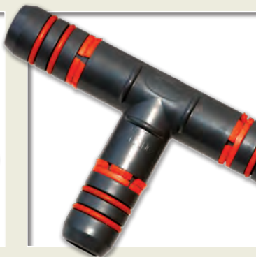
KwikConnect™ Tee 1"