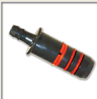
KwikConnect™ End of Line 1"