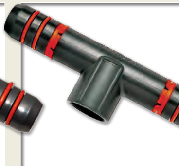
KwikConnect™ Reducing Tee 1"