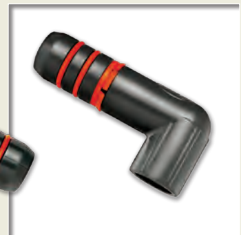
KwikConnect™ Reducing Elbow 1"